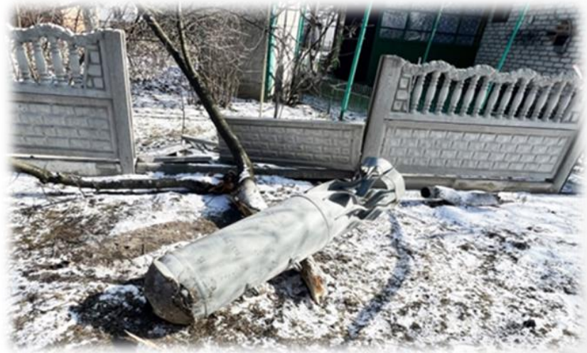
Bomb 500 kg