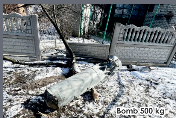
Bomb 500 kg