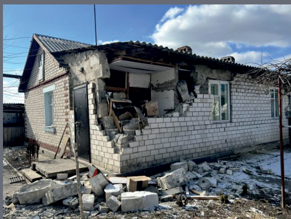
(Private houses that were destroyed)